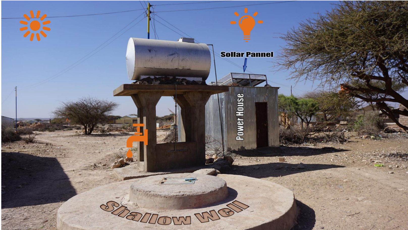
Solar system and Elevated water tank