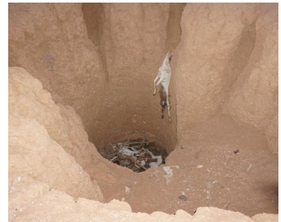
Shallow well turned into animal carcass dump

Factors: Climate Change, conflict, poverty and fragile ecosystem