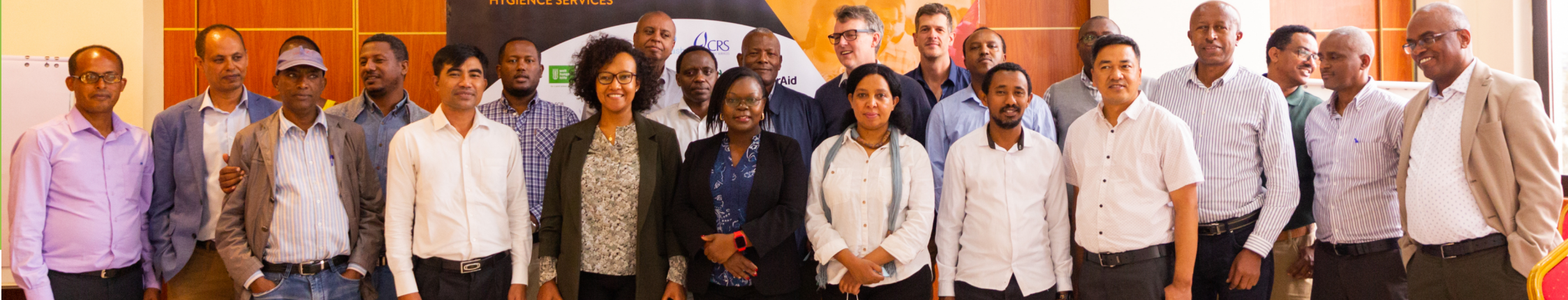
Agenda for Change members from CARE, CRS, Helvetas, IRC, Splash, WaterAid, Water for Good, Water For People, and Welthungerhilfe gather with stakeholders from the Ethiopia Ministry of Water and others on Day 2.