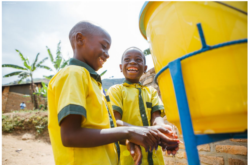
Two boys washing hands at a school in Rulindo district, Rwanda

WaterAid, Water For People, World Vision, and WASAC have been piloting the district-wide approach in six districts, which will result into a costed WASH Investment Plan for these districts that will eventually be scaled up countrywide. In 2019, the rollout of the district-wide approach proceeded well, and the government committed to a countrywide rollout.