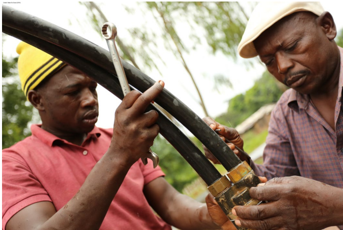
Water for Good maintenance team members at work in the Central African Republic

WaterSHED conducted its fourth sanitation leadership development program for local elected officials, Civic Champions , in 2019. Throughout this year-long training and learning program, WaterSHED works with commune councilors to approach sanitation as a leadership practice problem. A recent evaluation of the scaled-up program confirmed that it had a significant effect on toilet sales, and that the results were sustained over time. Read more .