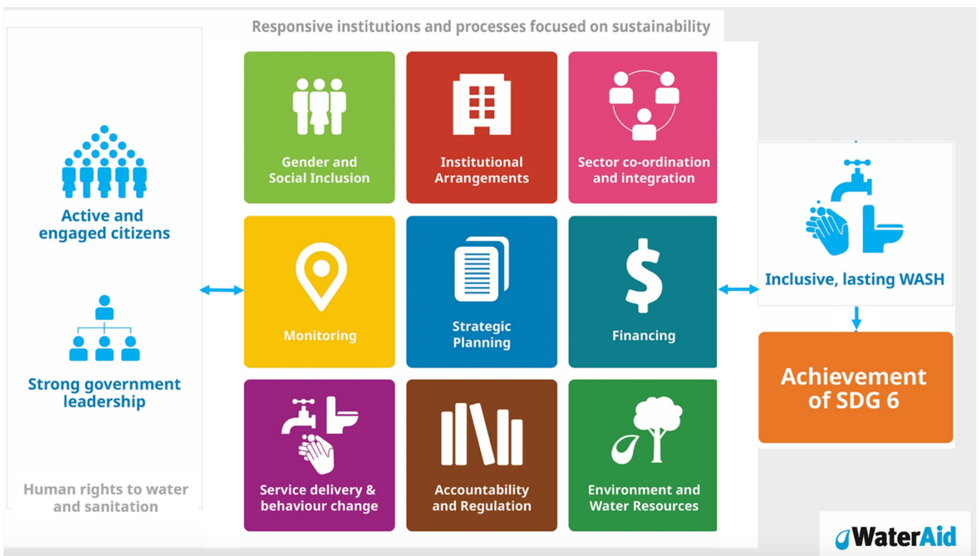
Figure 1: WaterAid’s Approach to Systems Strengthening

Right now, hundreds of millions of people do not have access to clean water, decent toilets, or good hygiene. And many of those who do have access suffer from inadequate levels of service: poor water quality, service outages, toilets not being emptied and hygiene behaviors are forgotten or not practiced. But there are solutions, and it is not just about installing more taps and toilets. It’s strong systems, engaged citizens and government leadership that will keep the taps running, the toilets working and reinforce hygiene habits. The system is complicated, with many different people, institutions, and processes involved. This can lead to bottlenecks. In addition to delivering services and promoting good hygiene habits, WaterAid works to strengthen the whole system, to create real and lasting change.